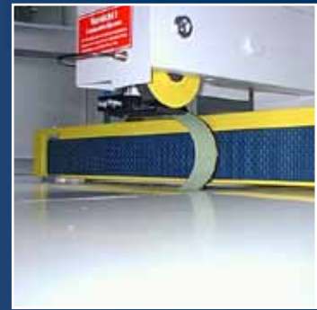
Fig.: Knife guide